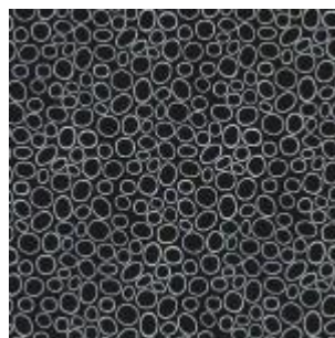
Michael Miller Fabrics Collections Sweet Emma Flower Drift (L) and Lovely Llamas Rocky (R)